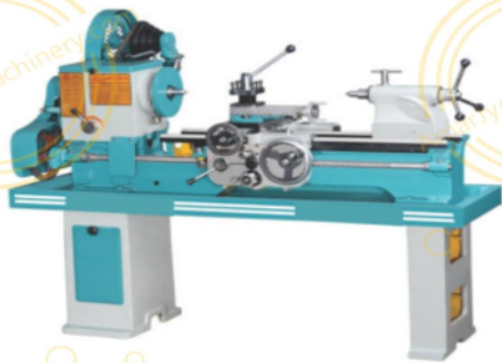
LITE DUTY PRECISION LATHE MACHINE UPTO 40MM