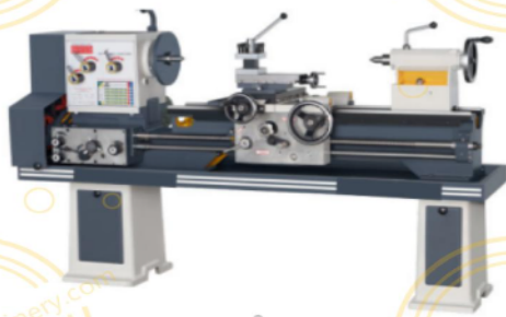
MEDIUM DUTY ALL GEAR LATHE MACHINE UPTO 80MM