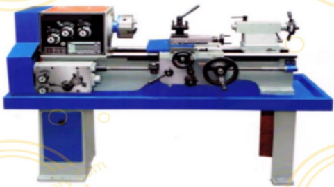
LITE DUTY ALL GEAR LATHE MACHINE UPTO 40MM