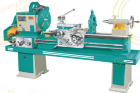
MEDIUM DUTY PRECISION LATHE MACHINE UPTO 80MM